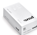
Table Knife matt