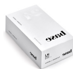
Table Knife silver plated 40 microns